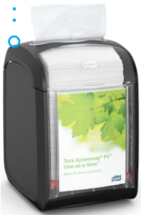
Tork Xpressnap Fit Tabletop Napkin Dispenser

Tork Xpressnap Fit tabletop and countertop dispensers, together with Tork refills in white and natural, allow you to increase your efficiency by reducing refill times by more than half and promote hygiene with your guests.