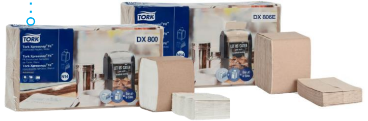
Tork Xpressnap Fit System Refills

Get your message across with AD-a-Glance® customizable display panels: torkusa.com/services/ad-a-glance