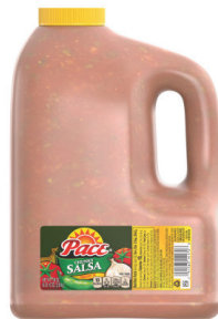
Pace ® Medium Chunky Salsa 14170