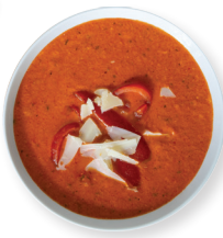
Reserve Roasted Red Pepper Tomato & Gouda Soup 16835