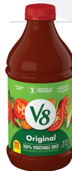
V8 ® Vegetable Juice 46 oz | 20808