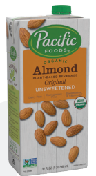
Unsweetened Almond 06503

54% OF ADULT CONSUMERS want to get more vegetables in their diet. 2