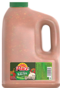
Pace ® Mild Chunky Salsa 14070

Include salsas with menu items for a touch of Mexican influence.