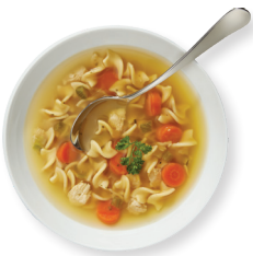
Signature Chicken Noodle 20303