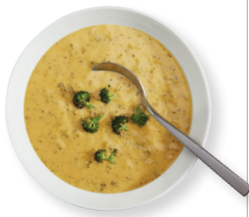
Signature Broccoli Cheddar 20301

ITALIAN Signature Italian Style Wedding Soup | 10428